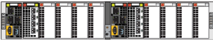
Data Mover Enclosure 1 (optional)