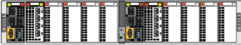
Data Mover Enclosure 0