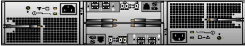
2u Disk Array Enclosure (DAE)