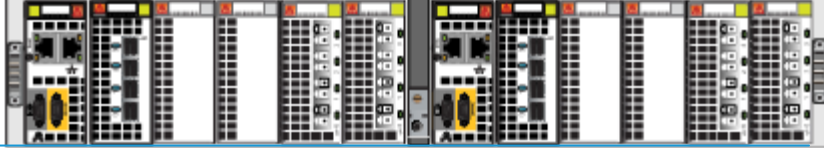
Storage Processor Enclosure (SPE)